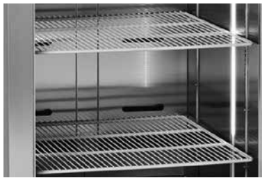
Heavy-duty epoxy coated shelves on LB models